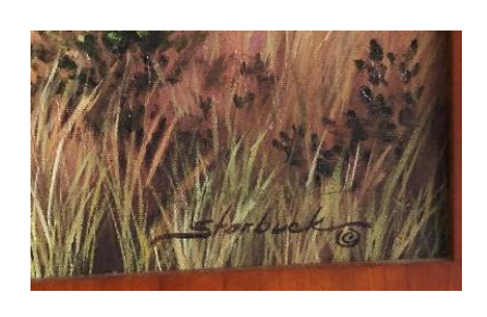
Closeup of Signature