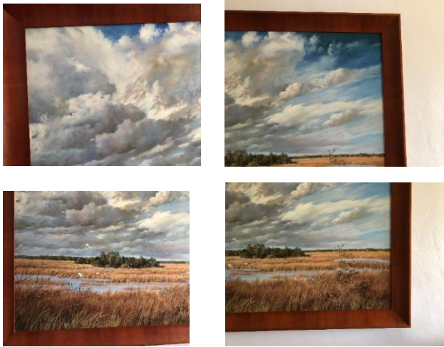
Closeup of the four quadrants of the painting