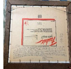
Full Back with Frame