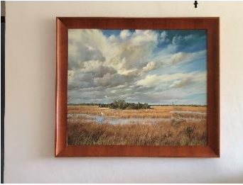
Full front with frame

Minimum of 7 Images Required for an Appraisal ( take additional photos of everything of interest )