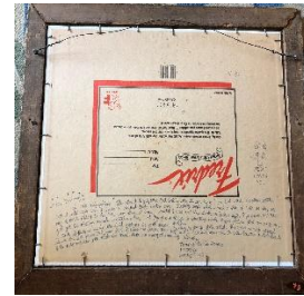
Closeup of Back