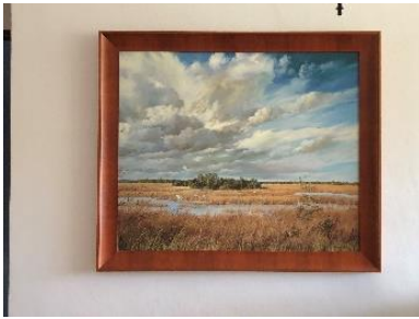
Full Front of Piece

Minimum of 7 Images Required for an Appraisal ( take additional photos of everything of interest )